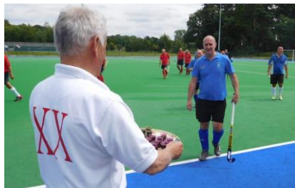
Master of Ceremonies