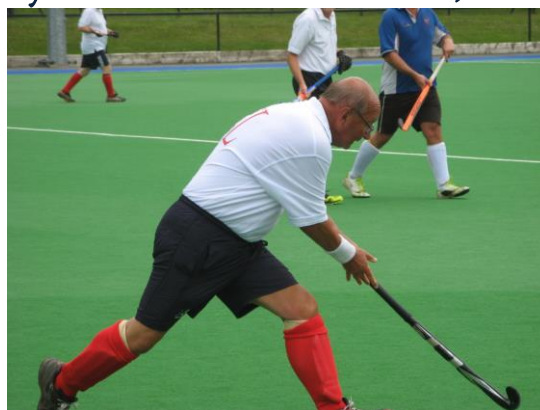
Poetry in Motion